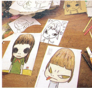
"Having to sharpen colored pencils while I'm in the middle of a drawing is a bit of a pain..."