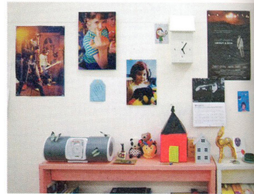
"My studio walls are covered with posters of my heroes: the Ramones, Bob Dylan, Kurt Cobain. When I play loud music in the middle of the night, it feels like my studio is a spaceship and I'm going on a voyage in zero gravity."